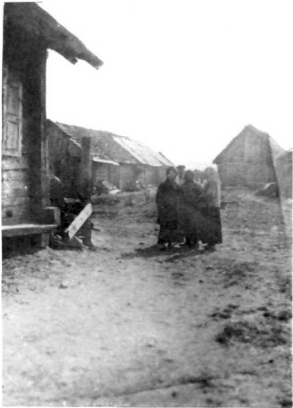
THE PEASANTS SOMETIMES ASSUMED AN ATTITUDE OF WATCHFUL WAITING