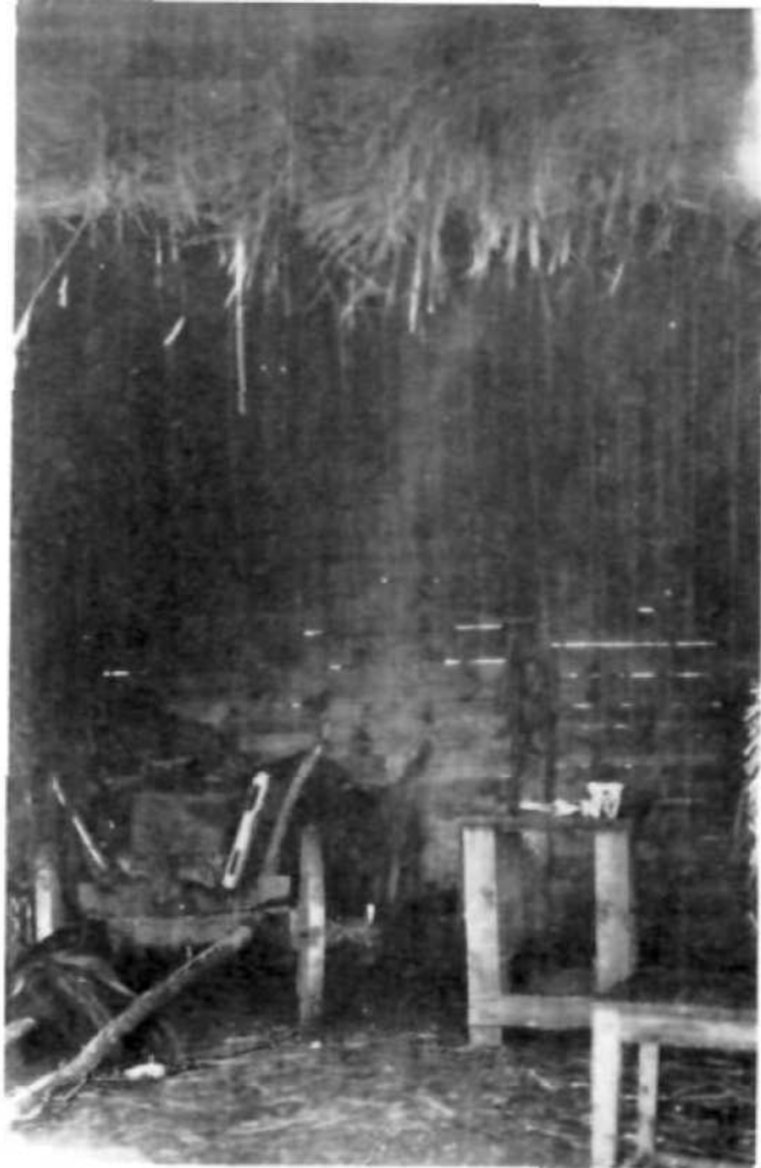
MY PERSONAL BAGGAGE WAGON INSIDE MY BILLET