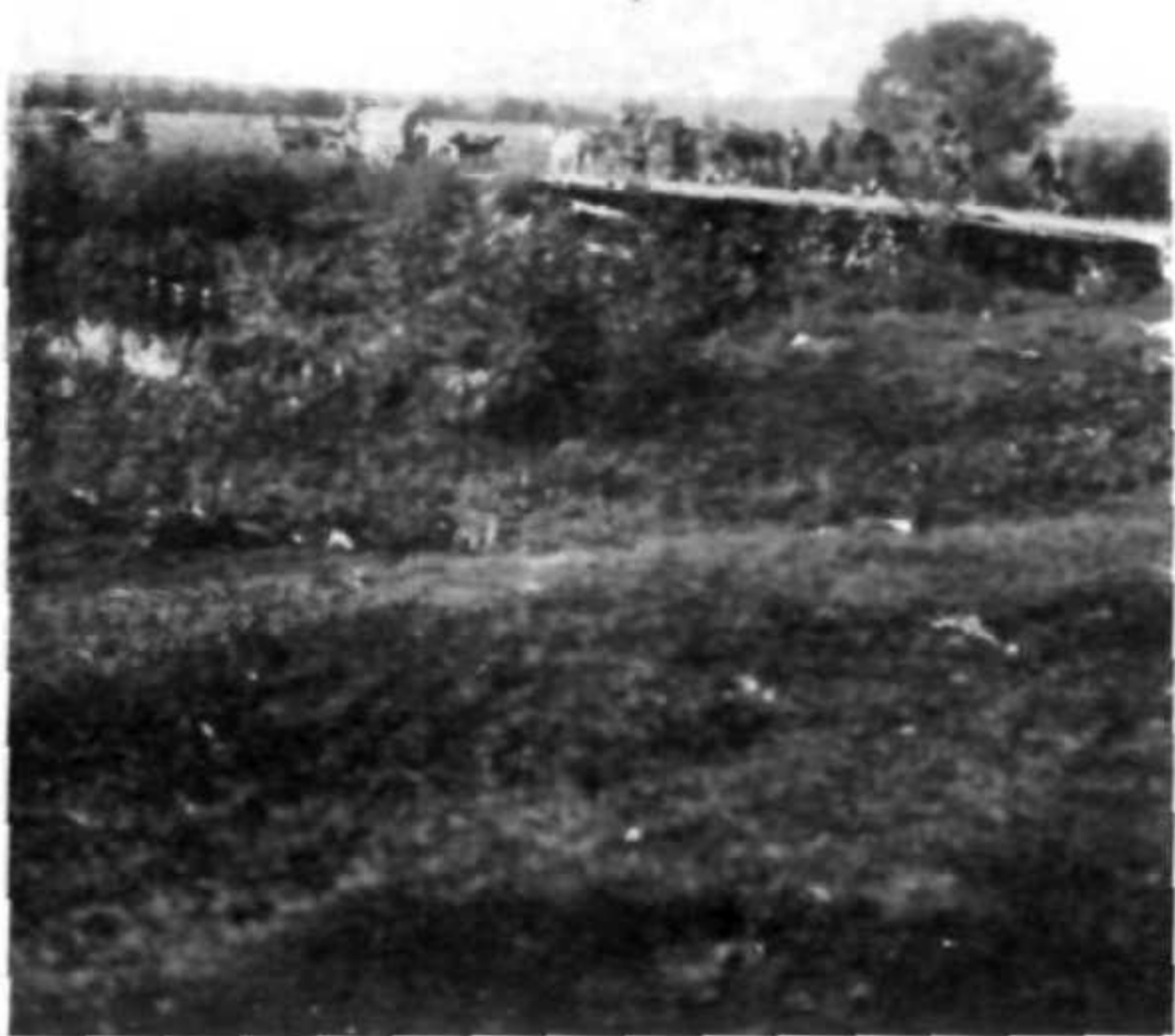
THE COUNTRY OVER WHICH THE BATTLES WERE FOUGHT