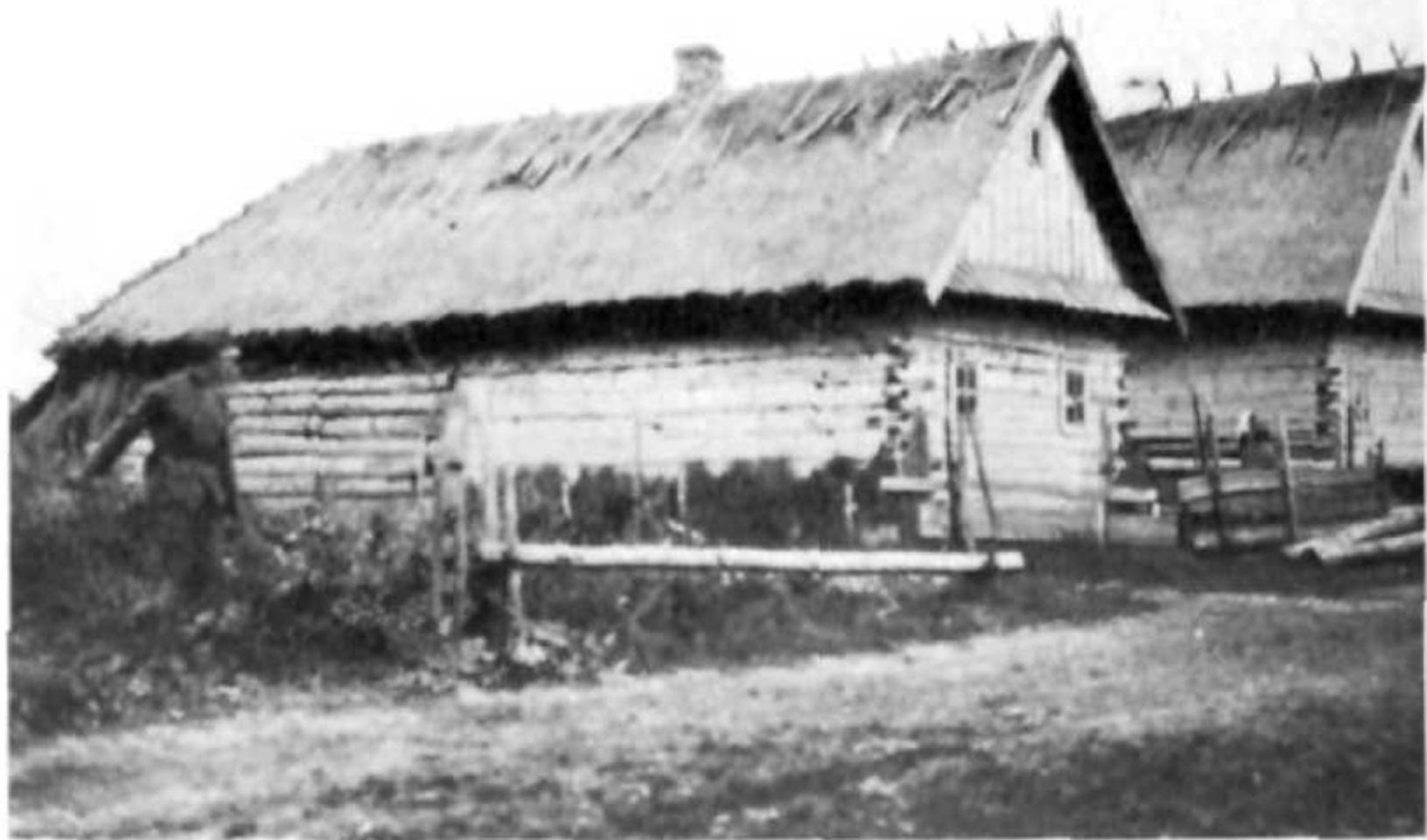
A TYPICAL WHITE RUTHENIAN HUT