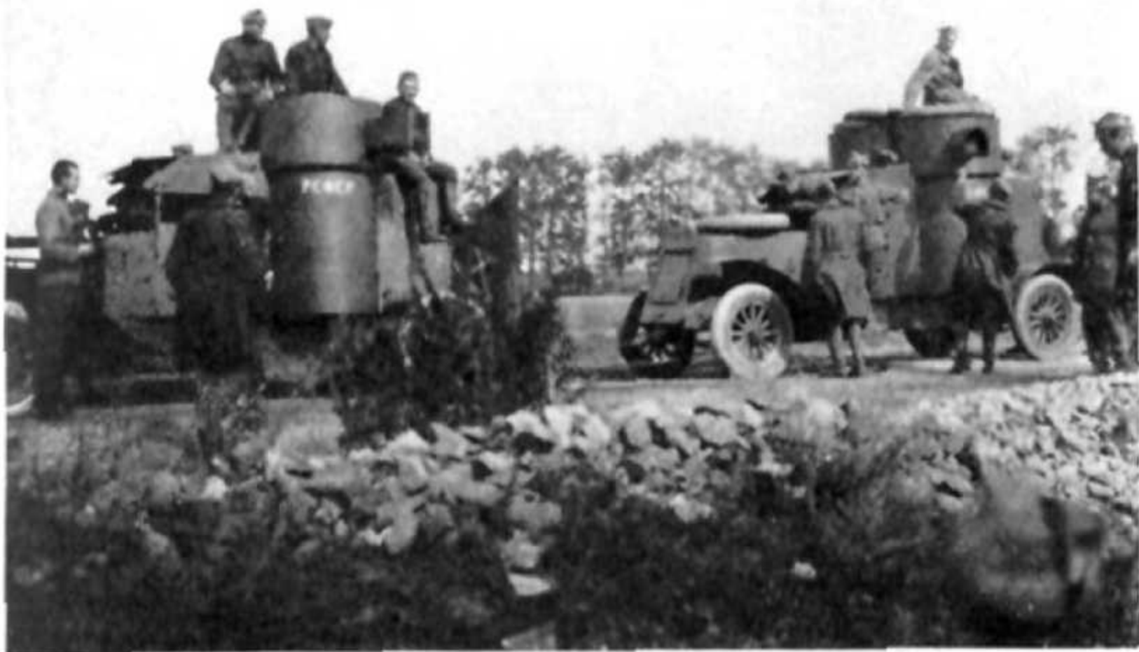
THE CARS WERE DRIVEN WITH THEIR OWN POWER INTO THE POLISH LINES