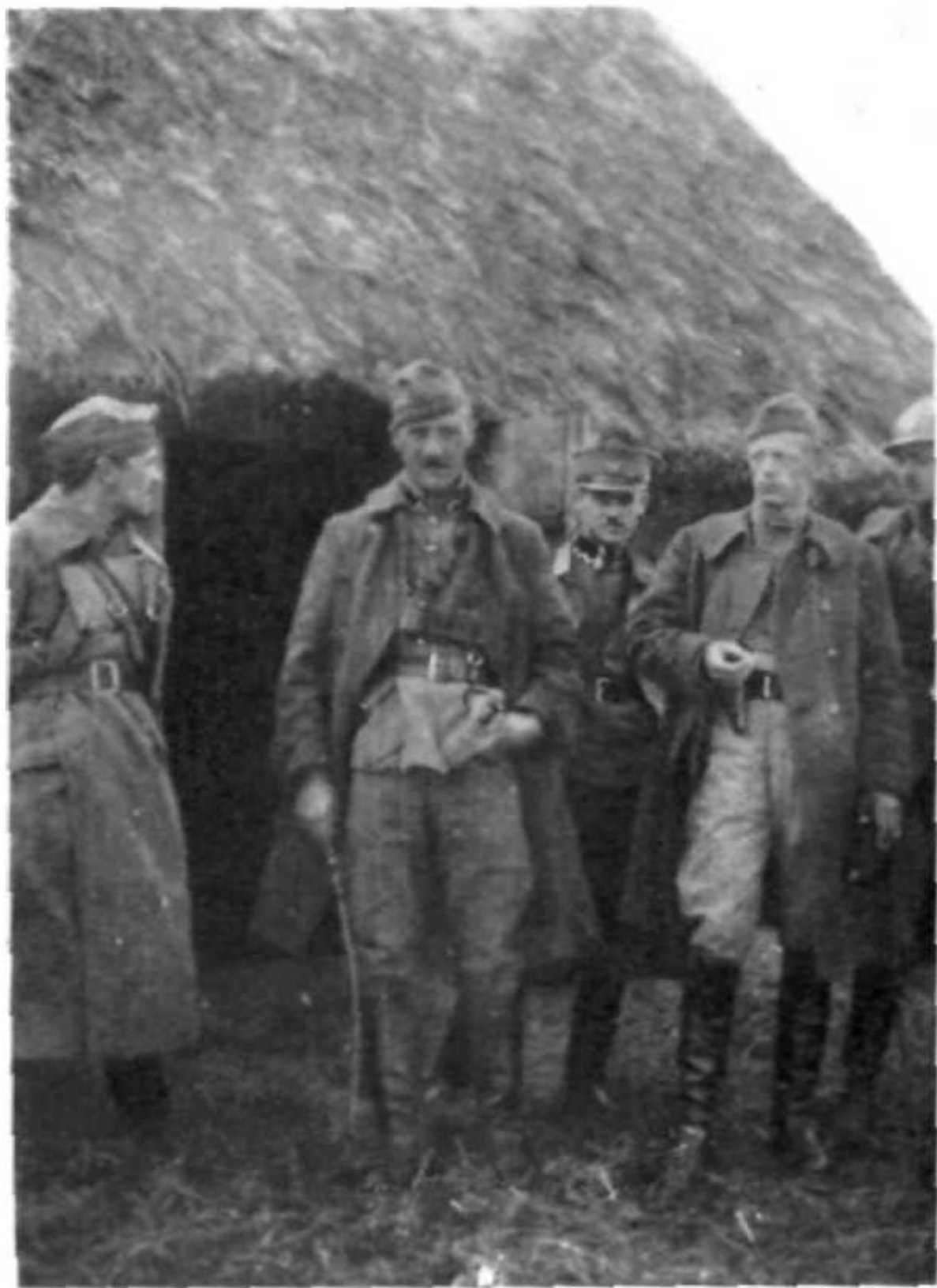
A GROUP OF OFFICERS IN THE BATTALION