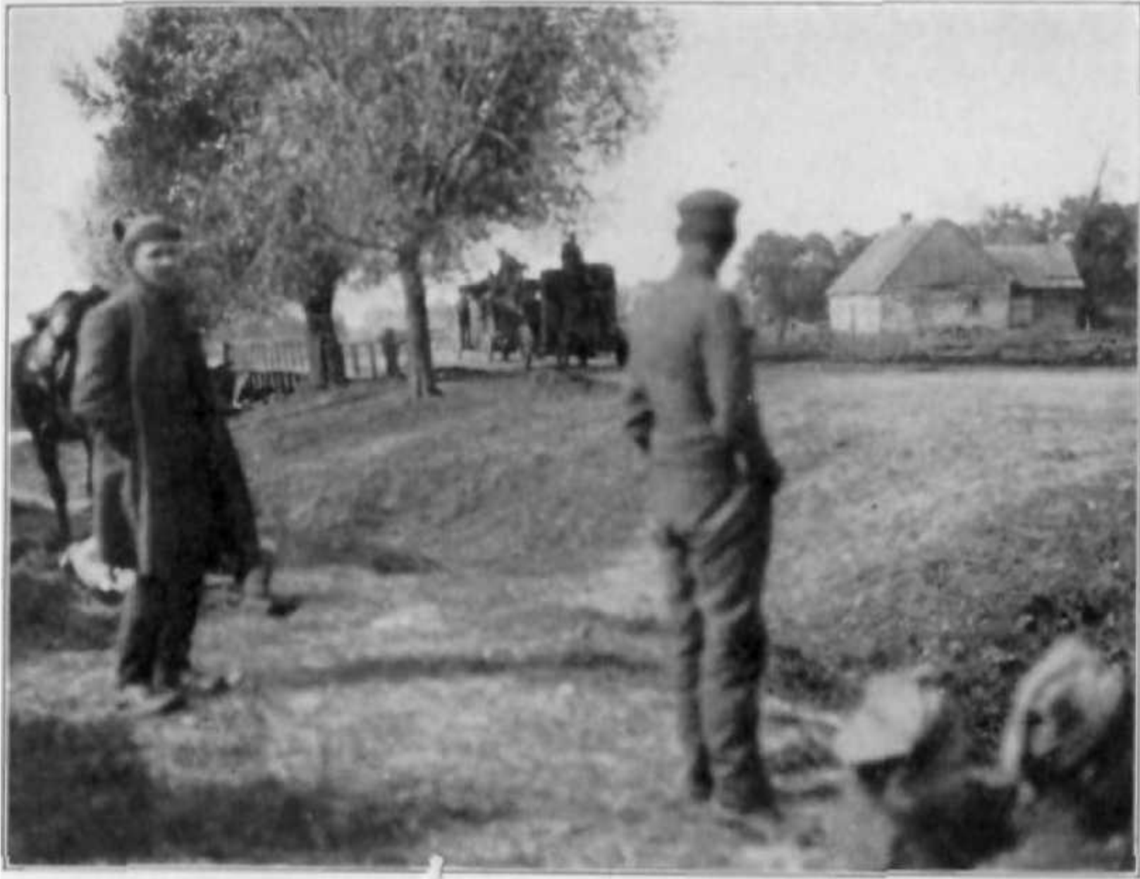
BRINGING IN CAPTURED BOLSHEVIK ARMORED CARS