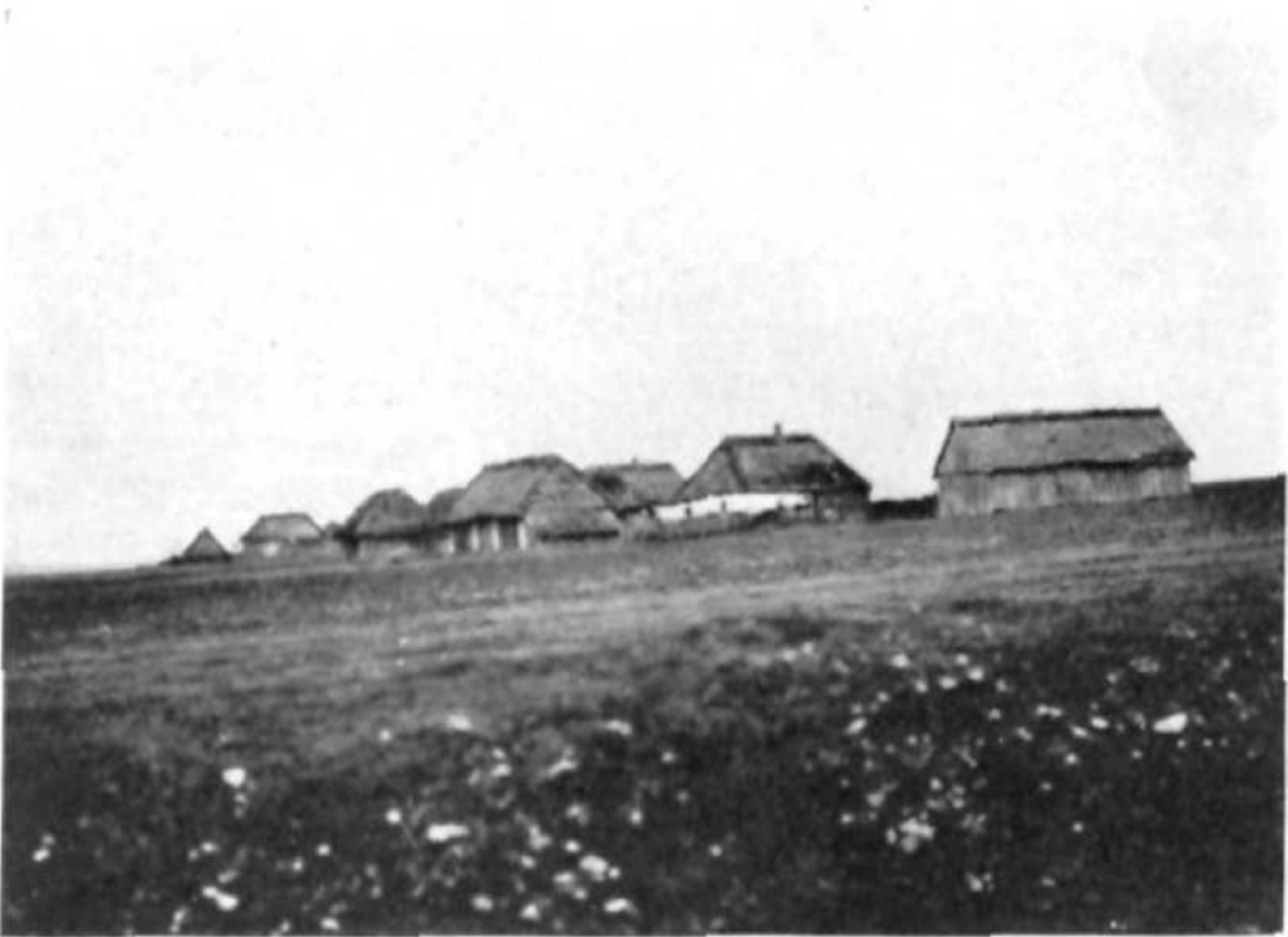
A TYPICAL VILLAGE IN EASTERN POLAND