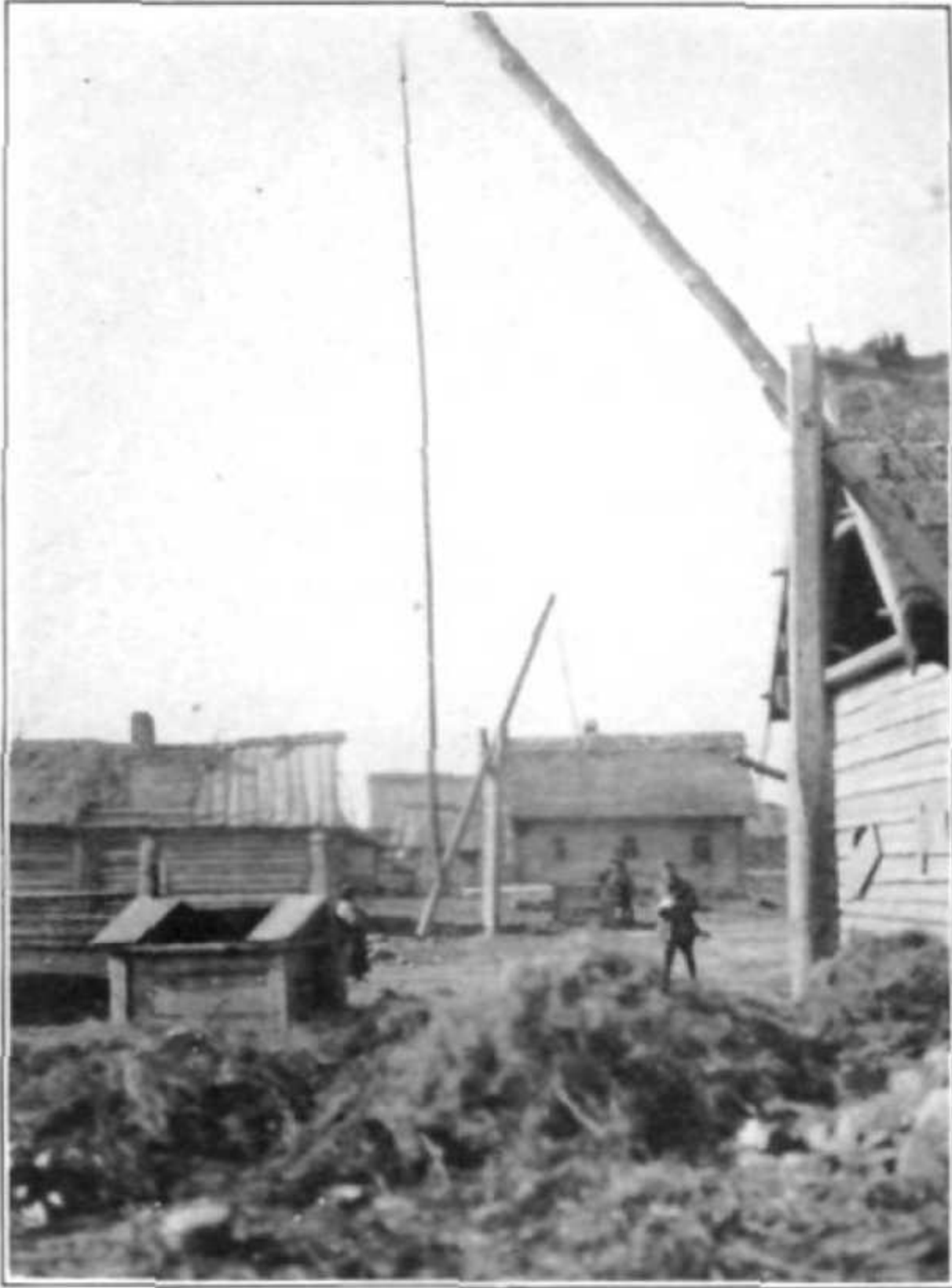
IN A POLISH VILLAGE