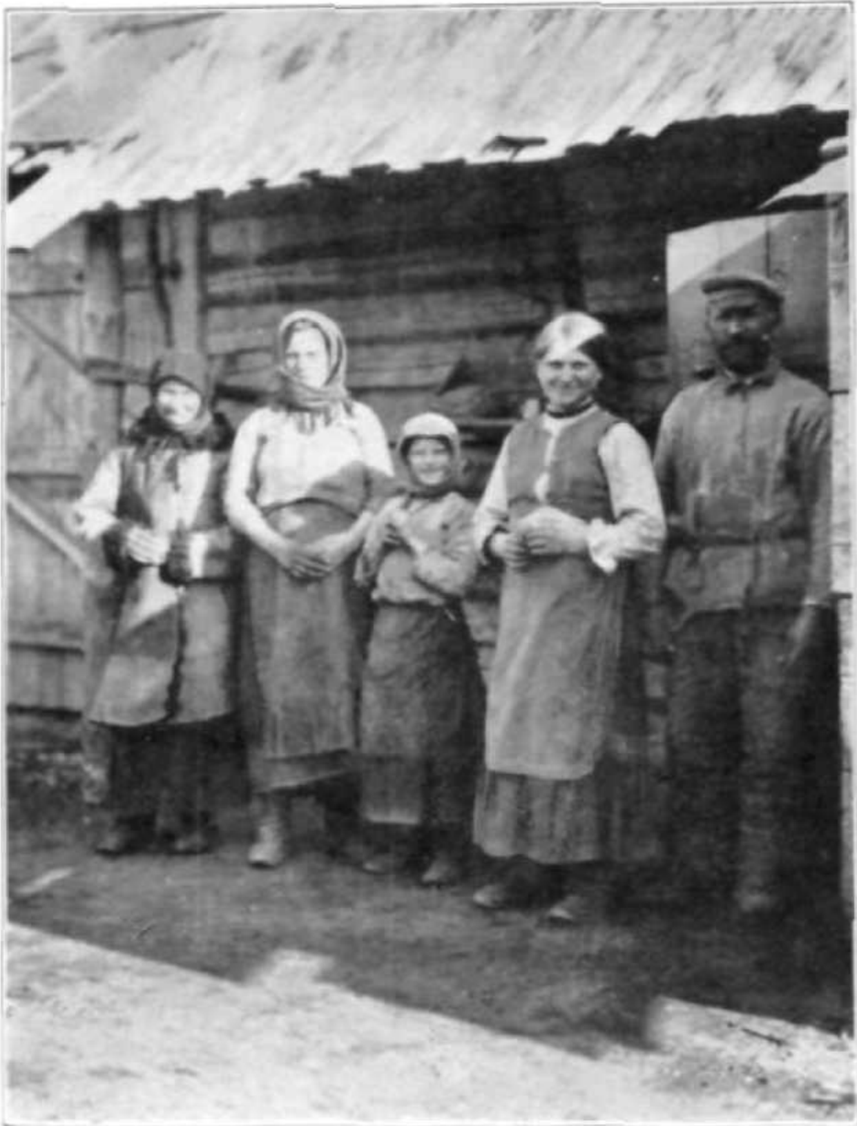
WHITE RUTHENIAN PEASANTS